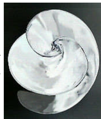
The PAX Mixing Impeller

When the company was founded, we expected commercialization of PAX products to take 12-18 months; in fact, due to the challenges I just mentioned, it has taken nearly 8 years. Recently, we decided to focus on creating a product for mixing large volumes of water. An initial test in a 1-acre lake showed that a PAX impeller could efficiently mix a million gallons of water while only drawing 1/15th horsepower. This was an astounding number, particularly since the industry standard suggested a one horsepower motor would be required for this volume of water.