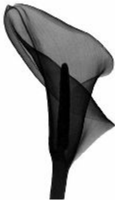
X-Ray of Calla Lily

The success of this project has been a turning point for PAX Scientific - companies from around the world are now showing an interest. The long-term potential is immense, due to the large number and types of devices that move fluids. We estimate that, over the next 20 years, PAX technology has the potential of reducing total world-wide energy usage by one-third.